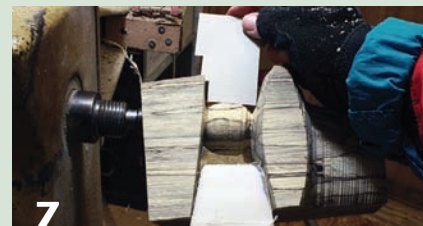
The toolrest is made from UHMW polyethylene.