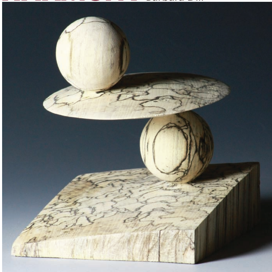
Harmony , 2013, Spalted wood, 5" x 4½" x 4½" (13cm x 11cm x 11cm)

Last year, the Professional Outreach Program (POP) committee invited me to be in their “Harmony” exhibit at the Tampa symposium, but I was not convinced I should take this on—I had never before intentionally turned a conceptual piece. I thought for a few days, talked to some people who encouraged me, and then accepted the invitation.