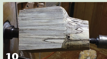
For security, strapping tape gives additional support for the wedge while turning.