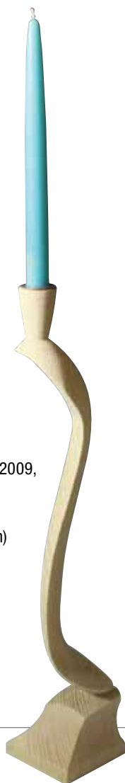
Candle Holder, 2009, Ash, bleach, 19½" x 3½" (48cm x 89mm)