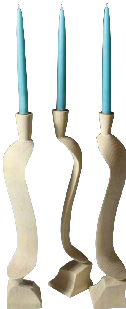
Trio Facing, 2009, Ash, bleach, 19½" x 3½" (48cm x 89mm)