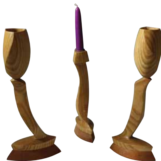
Trio Leaning Away, 2009, Ash, lacewood, 11" × 4" (28cm × 102mm)