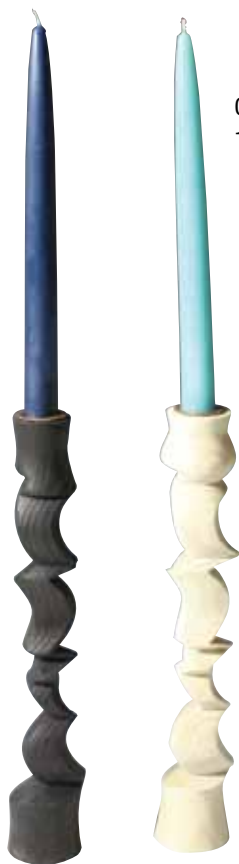
Candle Holders, 2009, Ash, bleach, dye, 12" x 2" (30cm x 50mm)