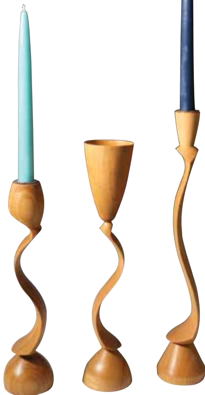
Goblet and Candle Holders, 2009, Cherry, 12", 14", 16" x 3" (30cm, 36cm, 41cm x 76mm)