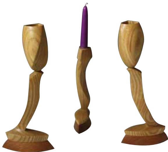
Trio Facing, 2009, Ash, lacewood, 11" × 4" (28cm × 102mm)